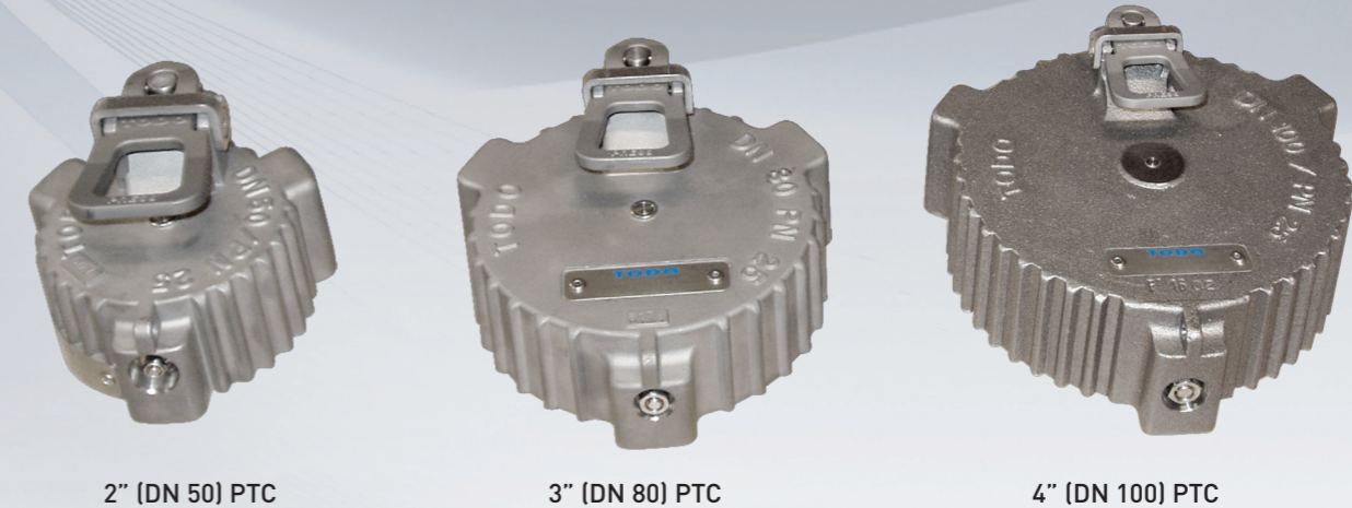
2" (DN 50) PTC