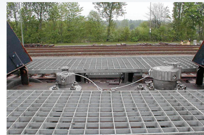
Approved as second closure on the top of tanks.